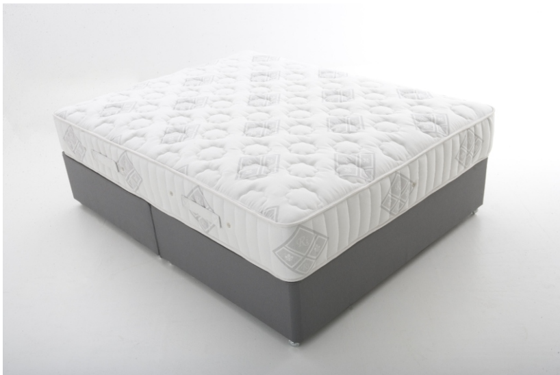
An exceptional Ri Multi-Coil spring mattress incorporating a double-deck system for outstanding comfort