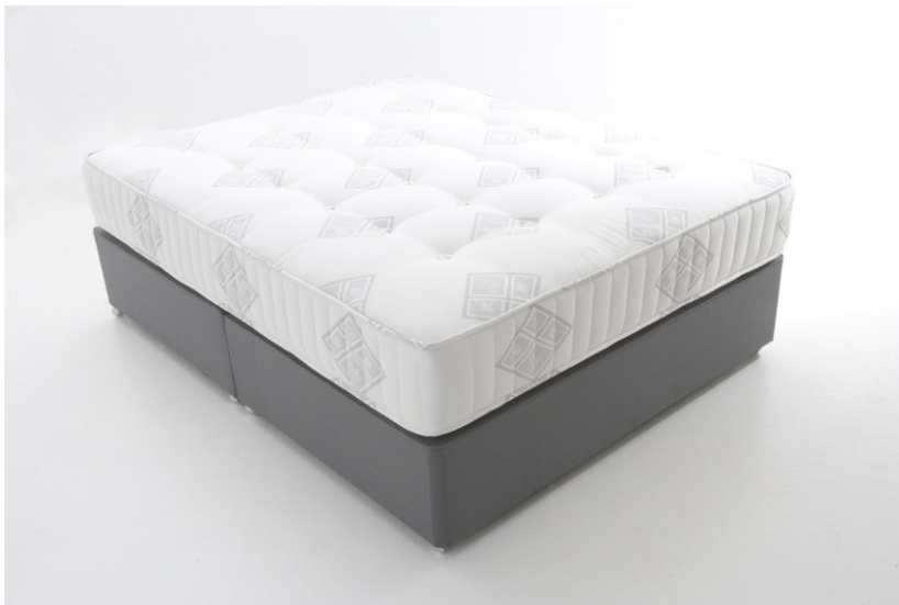
Outstanding comfort from this Ri Multi-Coil spring system