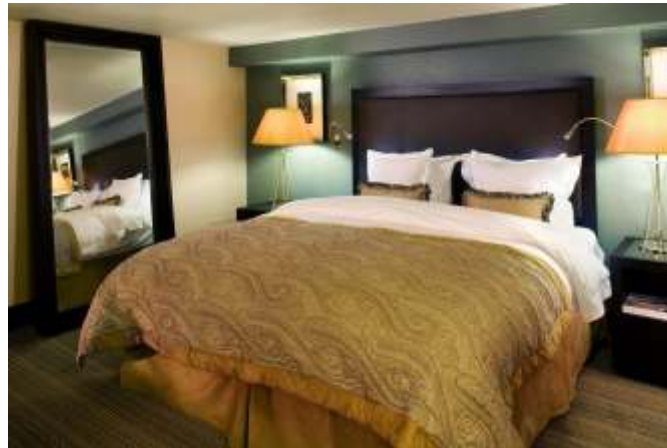
The Lygon Arms, Broadway (The R bed chosen for an interior designed by Max Bentheim Ltd)

The R bed is dressed in nothing less than the finest 100% viscose Belgium tickings