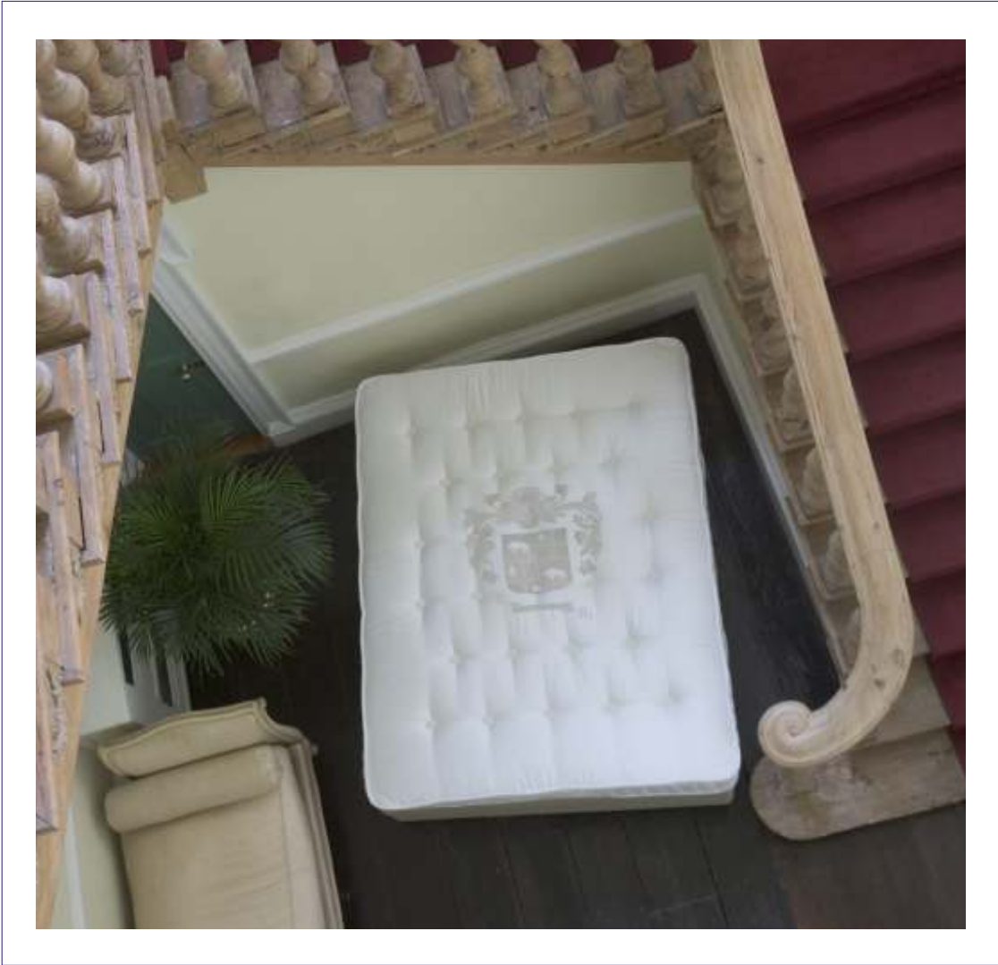
The Vogue Sublime with layers of lambs wool and talalay latex