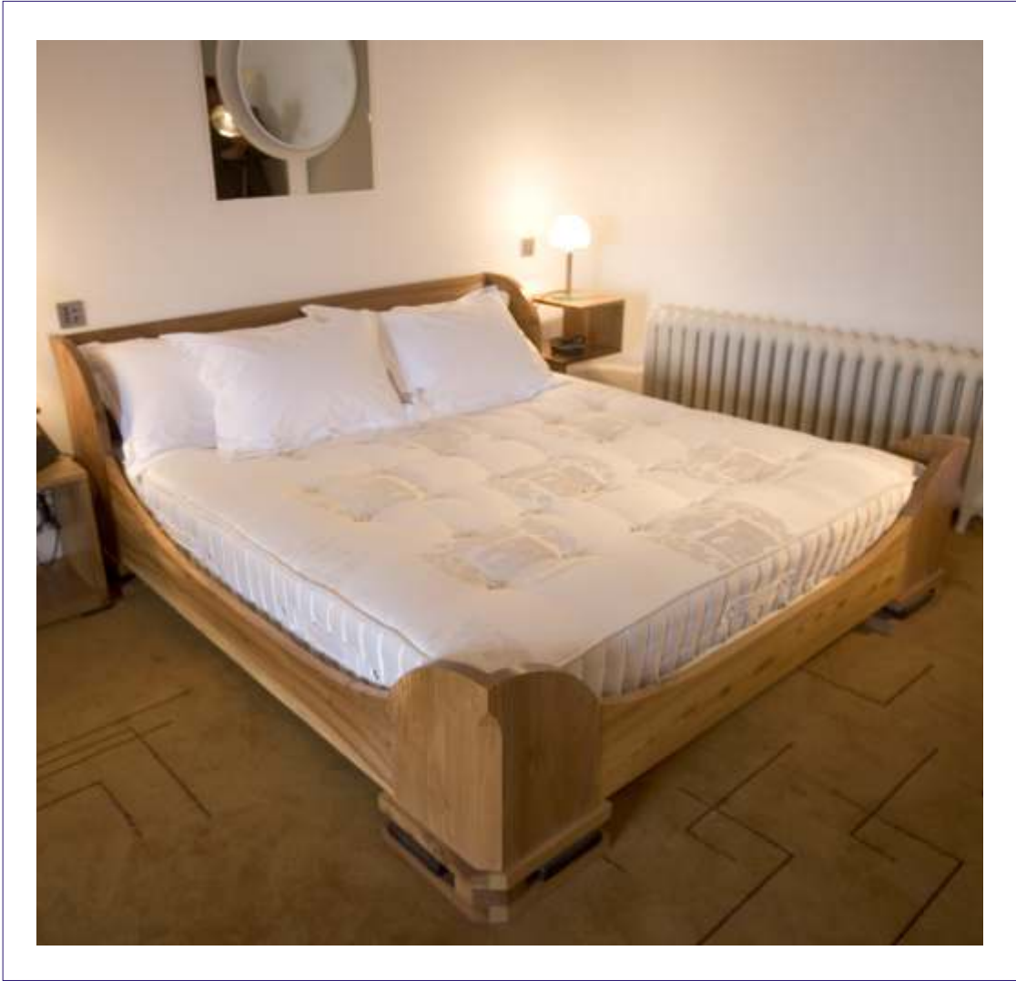
The opulent Vogue Elite compliments distinctive furniture (Bedframe unavailable)